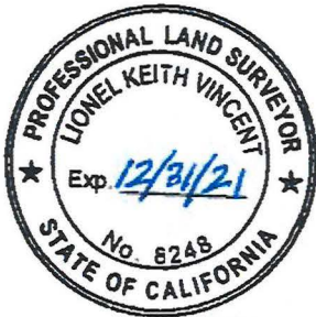
EXHIBIT A ANNEXATION OF 1499 LUCAS VALLEY ROAD

LANDS OF SOUANG Inst. No. 2014-0024717 APN 164-280-35 1501 LUCAS VALLEY ROAD